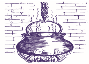
Pot of Soup

Please enclose a voided personalized cheque.